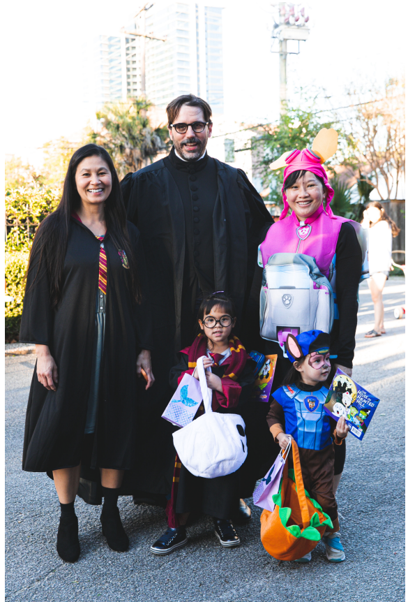
Local business sponsor, 2021 Trunk-or-Treat