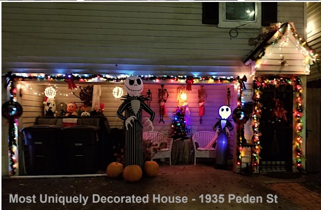
Most Uniquely Decorated House - 1935 Peden St