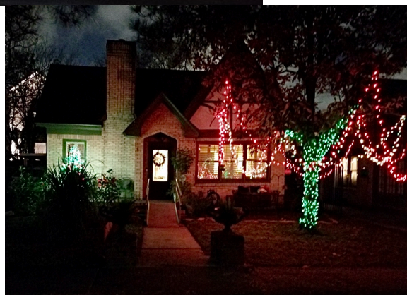
Best Decorated Bungalow 1806 Hazard St