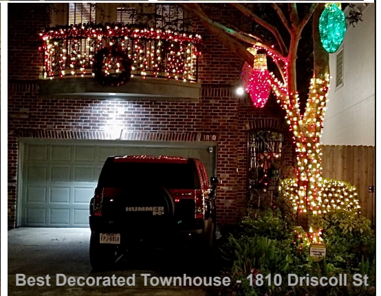
Best Decorated Townhouse - 1810 Driscoll St