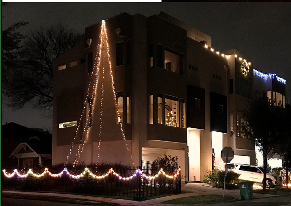
Best Decorated Townhouse Group Corner of Vermont & McDuffie St