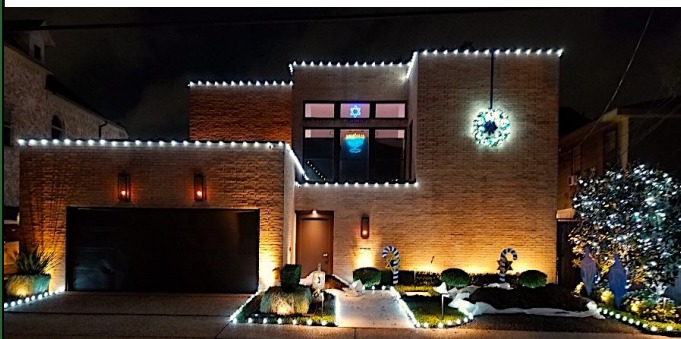
Best Decorated Single-Family House - 1506 Driscoll St

It's beginning to look a lot like Christmas, as the song goes! It's heartening to see so many homes being decorated for the holidays. Below are this year's winners of VCCA holiday decorations contest!