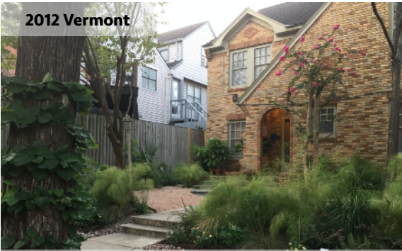
VCCA Yard of the Month