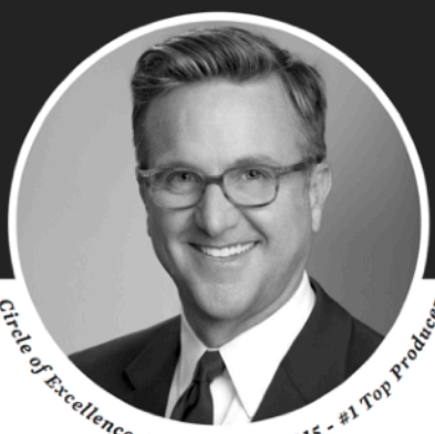
Circle of Excellence, Hall of Fame, 2015 - #1 Top Producer