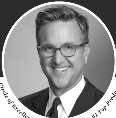
Circle of Excellence, Hall of Fame, 2015 - #1 Top Producer