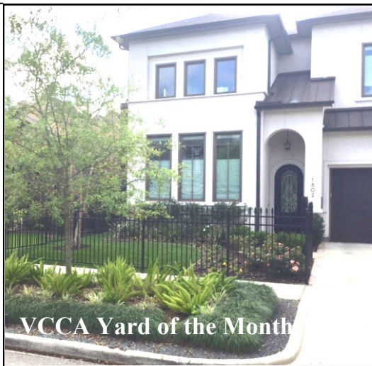
VCCA Yard of the Month