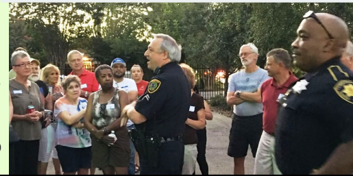
Photo 1: Some members of the organizing committee for NNO. Photo 2: Some past presidents of Vermont Commons. Photos 3 and 4: Officer Pate and Officer Groves share tips and best practices for keeping the neighborhood safe.

Vermont Commons is a very pet friendly neighborhood. It's wonderful to head down any street and see so many neighbors walking dogs, and we're happy to have the TNR team helping care for our area stray cats. But we do ask that everyone be mindful of the neighborhood as well. Please try to keep your dogs on a leash when you let them out or walk them, especially if you know they're very curious or aggressive. Many have posted on Nextdoor about dogs barking late at night. While we know that dogs will bark and need to go outside, please try to be mindful of the hours. Pets are welcome, we just want to work together to make sure we're not disruptive.