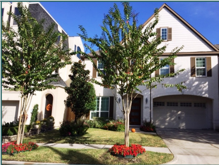
VCCA December Yard of the Month is 2201 McDuffie