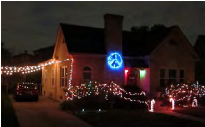
Home of "Overall Best" Winner

Happy Holidays, everyone! And remember - decorate EARLY and decorate BIG next year - so you can be a WINNER too!